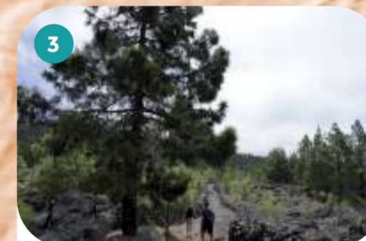
Canaries pine tree

Some of the paths in the town allow us to easily discover these enclaves, since many elements of the way of life and of traditional architecture have been very well preserved. Volcanic environments such as those surrounding Guía de Isora gave rise to a series of interventions that led to the creation of very interesting rural settlements. The patrimonial heritage that can be appreciated in these hamlets truly is an open-air ethnographic museum.